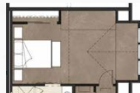
BEDROOM 3 OPTION