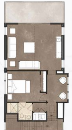
GAME ROOM OPTION