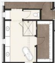
MASTER BATH OPTION 2