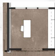
OFFICE BUILT-INS OPTION