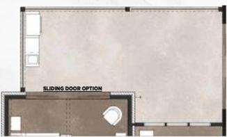
SCREEN PORCH OPTION