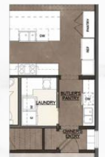
BUTLER'S PANTRY OPTION

WestsideLanding.com | 317 Hidden Beacon Bend, Austin, TX 78738 | 512.829.1478