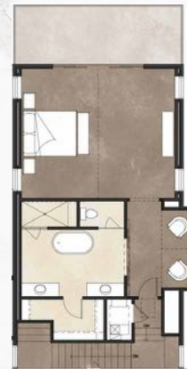
MASTER SUITE OPTION