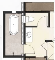
OUTDOOR SHOWER OPTION