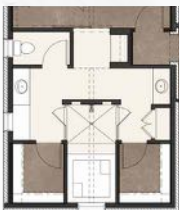
MASTER BATH OPTION 1